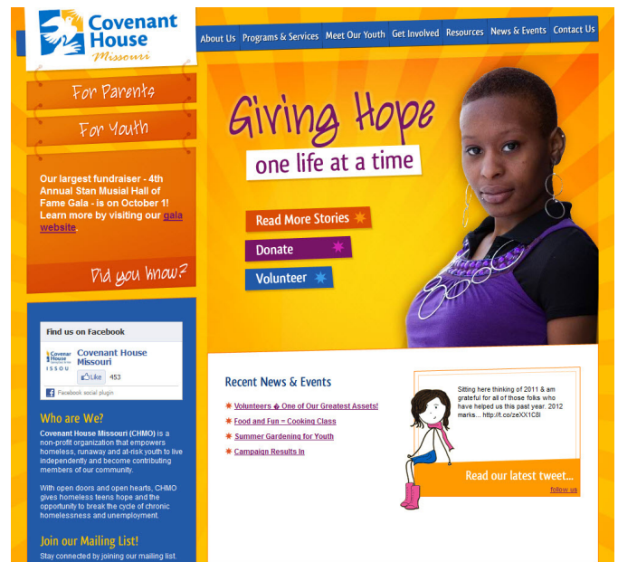
A great website example from Covenant House Missouri